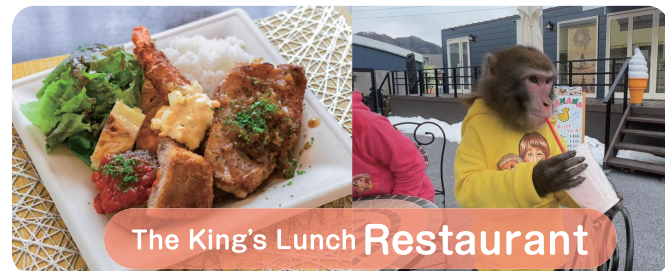
The King's Lunch Restaurant

1 coin (or 300 yen): Air hockey with monkeys, Monkey Oracles (Omikuiji), Monkey Catcher, Exciting pop-up OSARU game, Sleeping Cats & Cappybara House, Penguin Garden, Animal Valley entrance, Animal Valley feeding experience, Penguin feeding experience, Cappybara feeding experience, Cat feeding experience, Happy photo with a baby monkey, Photo opportunity on stage 2 coins (or 600 yen): Baby Monkey House for a limited time only: 3 minute interactive experience.